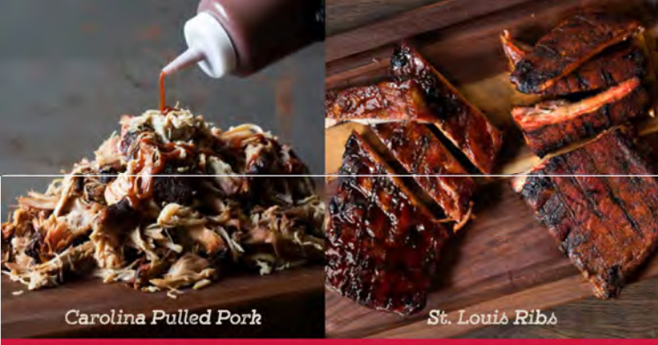
Carolina Pulled Pork